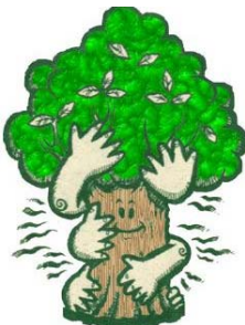
Schoharie County CARRT Center

Co-Hosted by The Child Advocacy Centers of Schenectady, Schoharie, Otsego and Columbia-Greene Counties