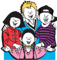
The Dr. Stephen and Suzanne Menkes Child Advocacy Center of Columbia Memorial Hospital

Please join us for a 2-day conference for professionals working as part of a multidisciplinary team in a Child Advocacy Center setting. Agenda and presenter information will be coming soon.